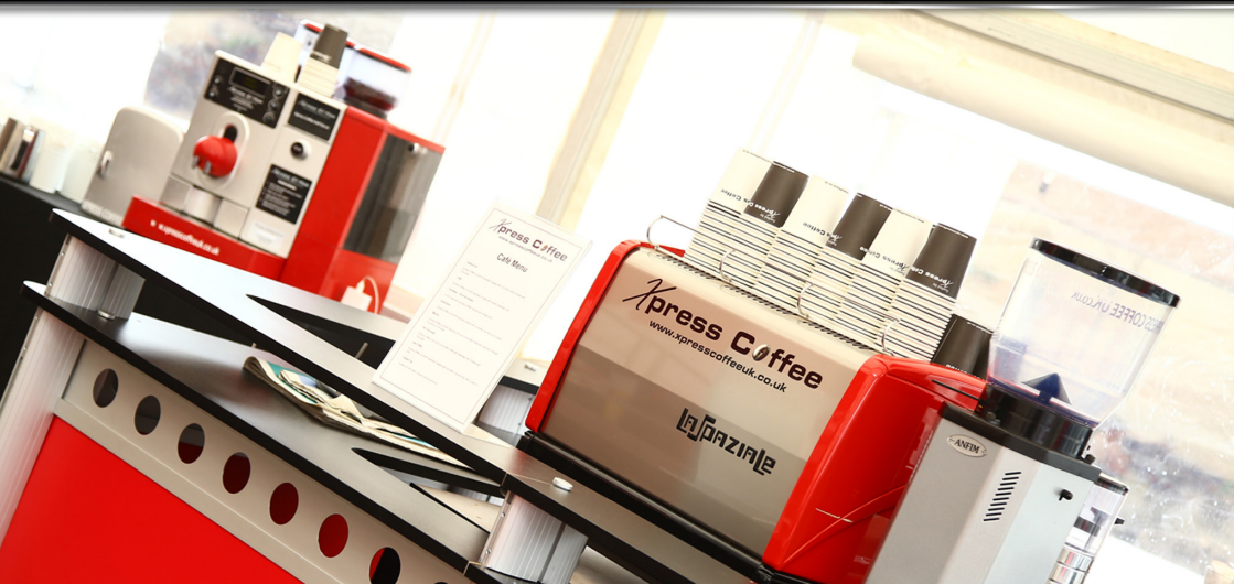
Milwaukee Yamaha Racing Team

“We have been very happy with the service received from Xpress Coffee, nothing is too much trouble & they seem intent on providing a good service which is a refreshing change! Would highly recommend.”