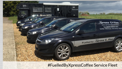
#FuelledByXpressCoffee Service Fleet

Our trademark FuelledByXpressCoffee racing brand also looks after and sponsors a number of race teams within MotoGP, Touring Cars, British and World Superbikes.