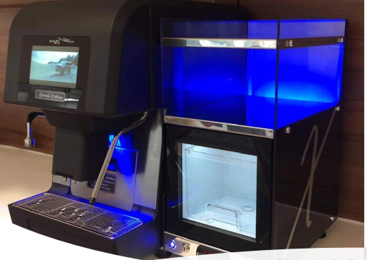
Jaguar Land Rover, Bracknell